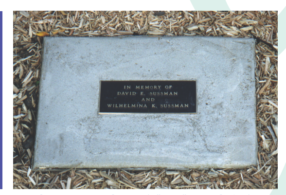
Cast-bronze tree plaque (4" x 9" actual size) mounted in concrete.