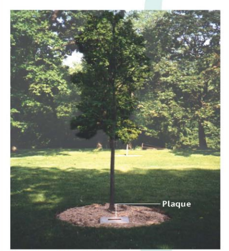
Tree donation with plaque.