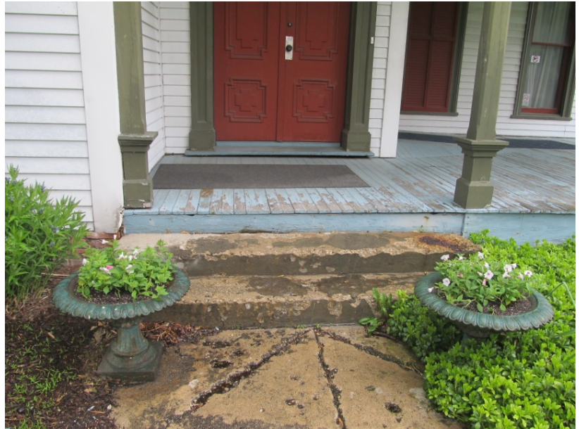
D2 – Caulk wood door trim