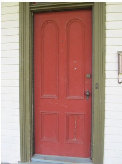
D5 – Replace rotted brick molding, install aluminum drip cap