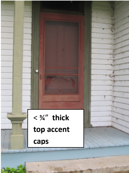
D2 – Caulk wood door trim