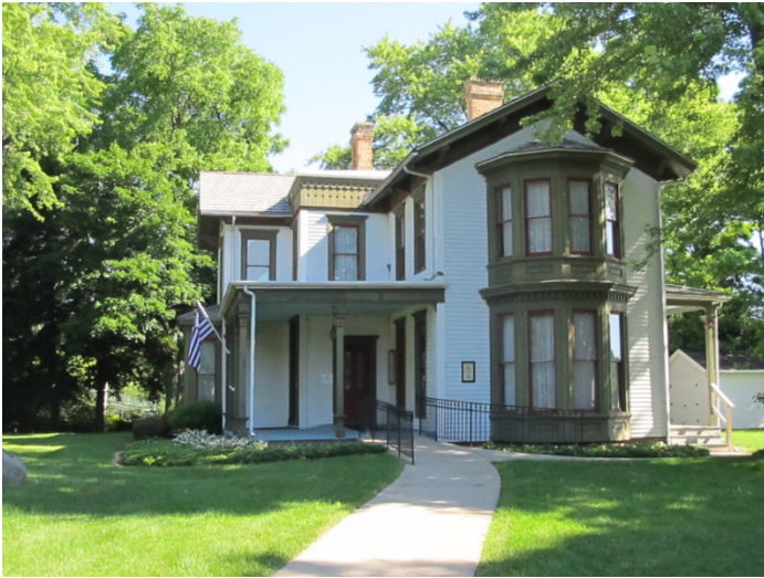
Close-up of Mock 1