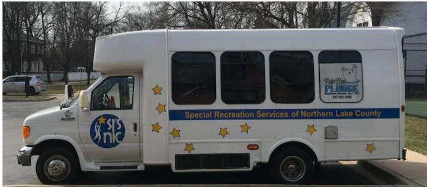
R60 Trade In Vehicle