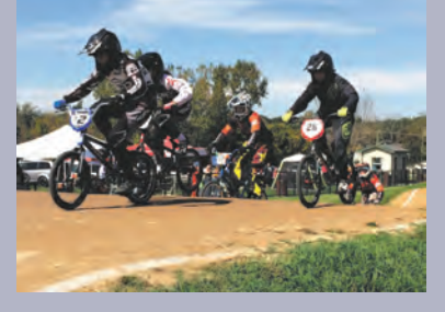
BEGINNERS ONLY RACE OTHER BEGINNERS OF THE SAME AGE

ALL RACES CONDUCTED UNDER THE SANCTION OF THE NATIONAL BICYCLE LEAGUE