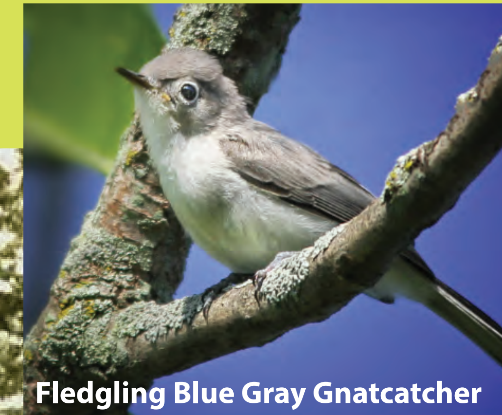
Fledgling Blue Gray Gnatcatcher