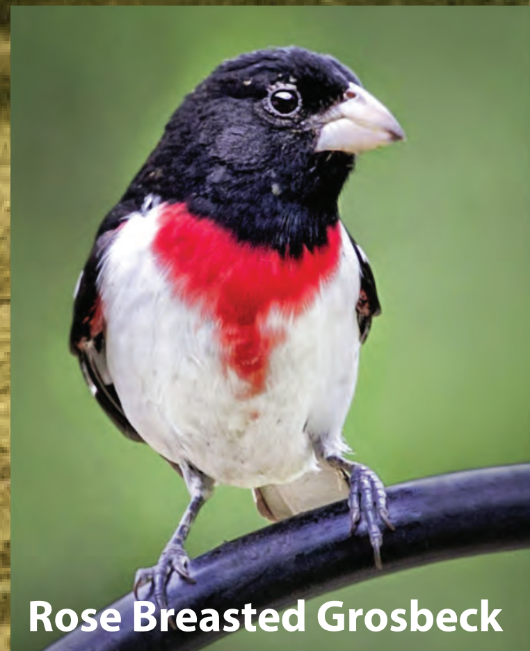
Rose Breasted Grosbeck