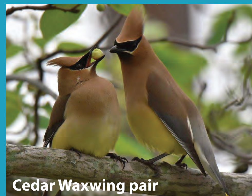
Cedar Waxwing pair