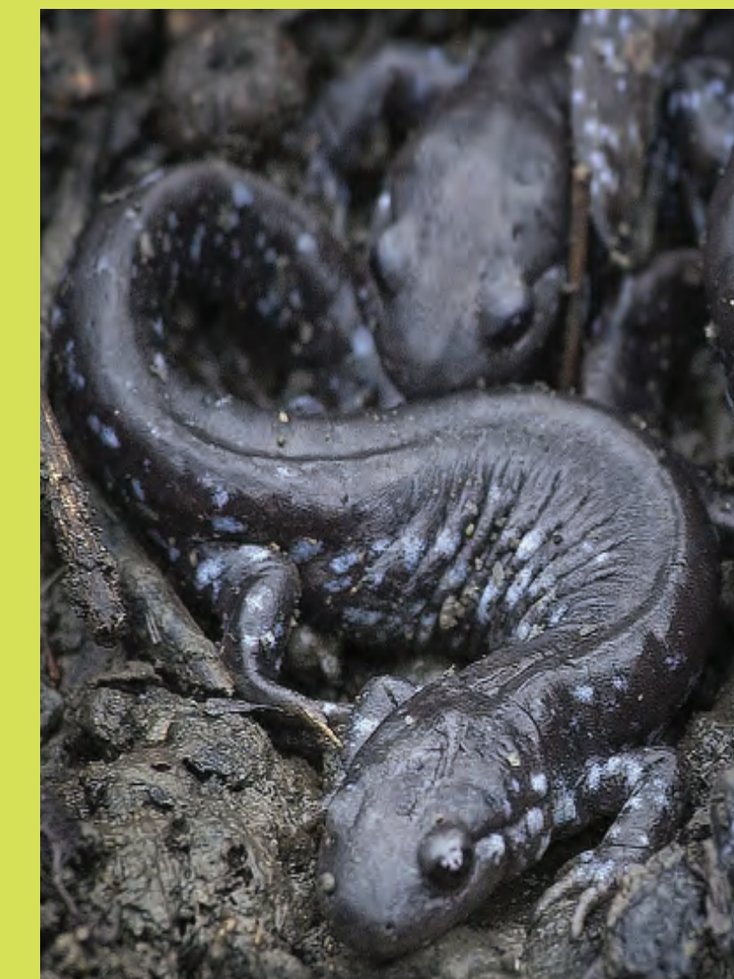
Blue Spotted Salamander

A natural spring fed the swimming pool at first until a renovation that was done in 1950, when a bathhouse, pump, and new pool were built over the existing one. Today, the frog pond here in Bowen Park replaces the Bowen County Club pool. In 1963, the directors of Bowen County Club informed the Waukegan Park District that the land was going to be for sale. Shortly after, the Waukegan Park District purchased the land and would turn it into today's Bowen Park, an award-winning park that continues to provide recreational opportunities.