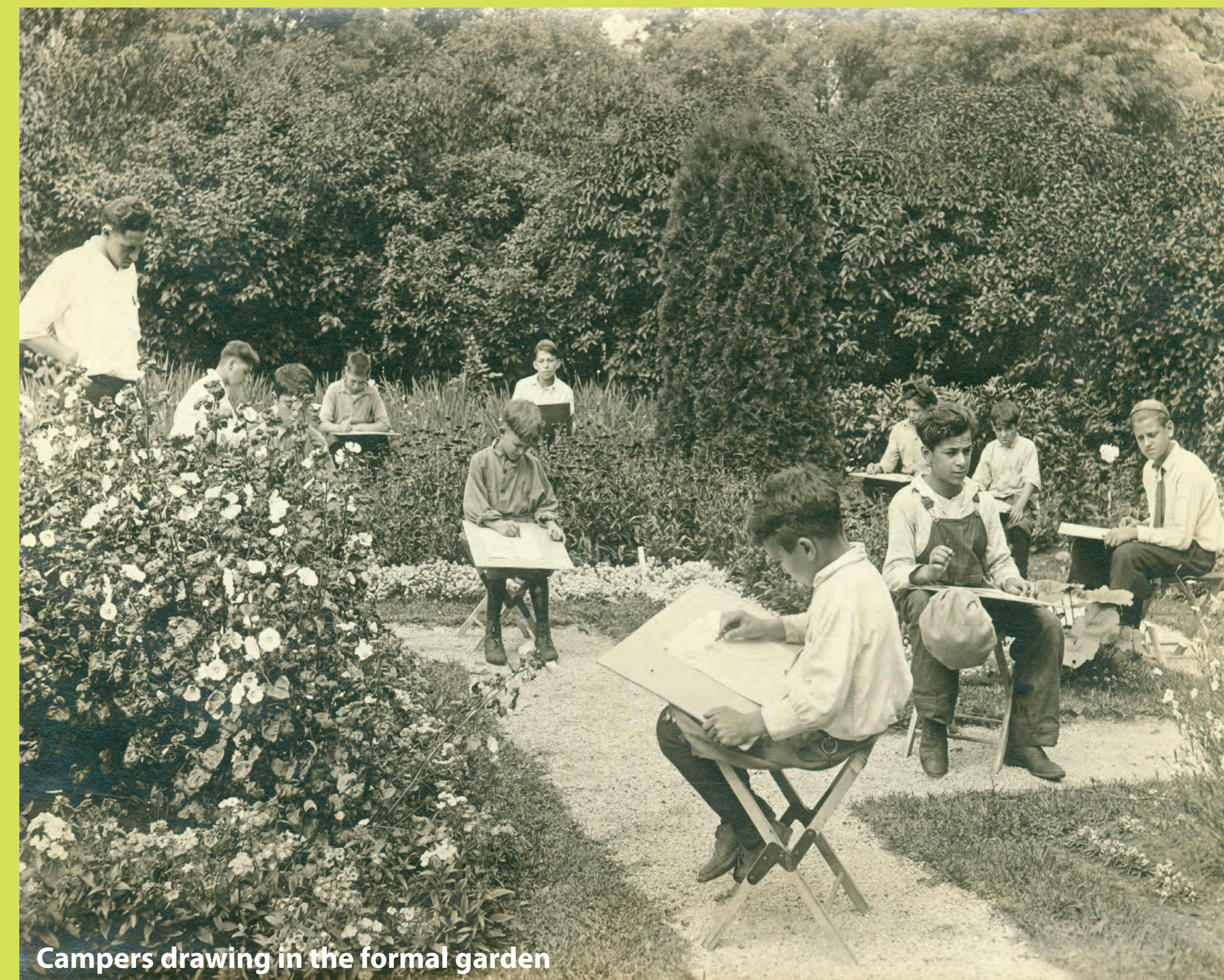
Campers drawing in the formal garden