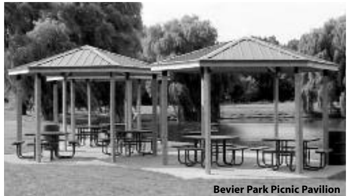
Bevier Park Picnic Pavilion

Additional picnic tables may be available at $10.00 each. Other miscellaneous services may be available to accommodate special needs. Call 847-360-4725 for information. All rentals require a $75.00 security deposit.