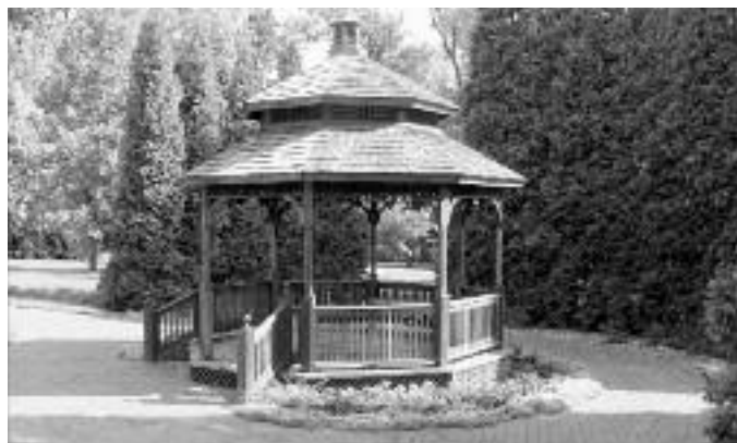
Bowen Formal Garden