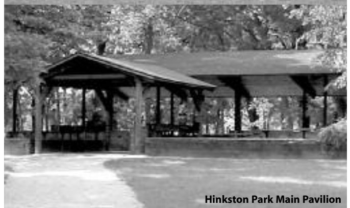
Hinkston Park Main Pavilion