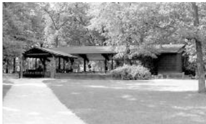
Hinkston Park Main Pavilion

Park Use Permit applications may be submitted beginning March 1 for the upcoming season. Applications are processed on a "first-come, first-served" basis.