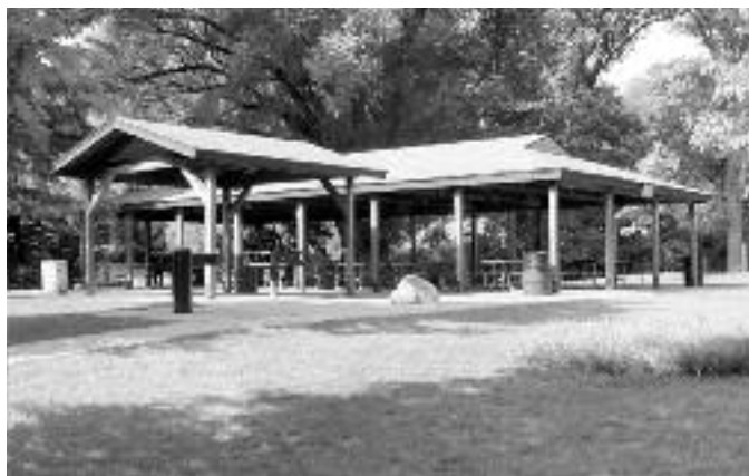
Janet and Robert Morrison Memorial Picnic Center in Bowen Park