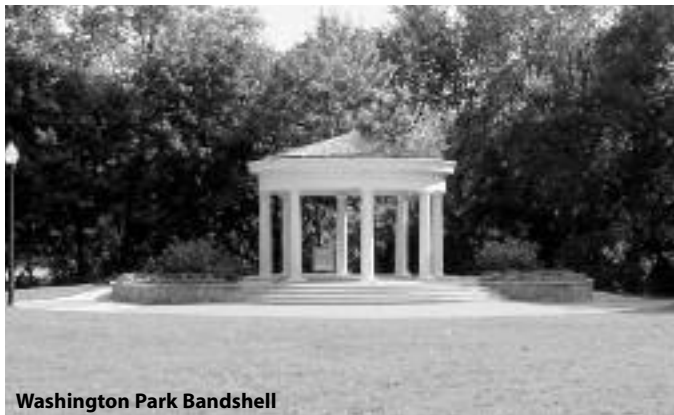
Washington Park Bandshell