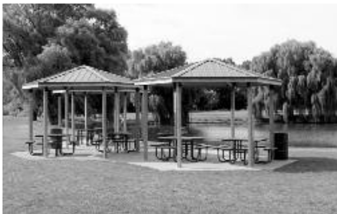
Bevier Park Pavilion