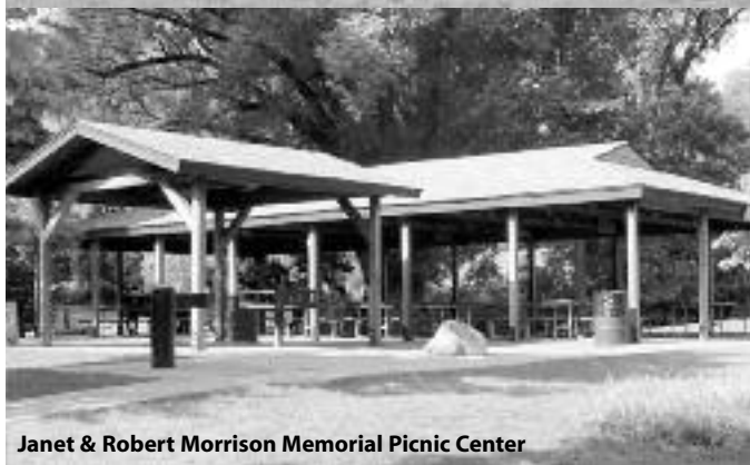
Janet & Robert Morrison Memorial Picnic Center