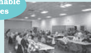
BRC Multipurpose Room Capacity: 150