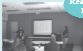
Field House Meeting Room Capacity: 60