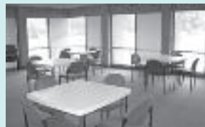
Belvidere Recreation Center Capacity: 40