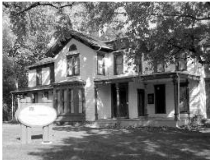
The Waukegan History Museum in beautiful Bowen Park.

Wednesday, Thursday, Friday: 10am-2:30pm and also by appointment.